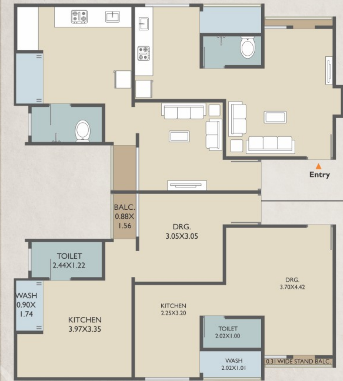
TOWER G-H 2 BHK TYPICAL FLOOR PLAN