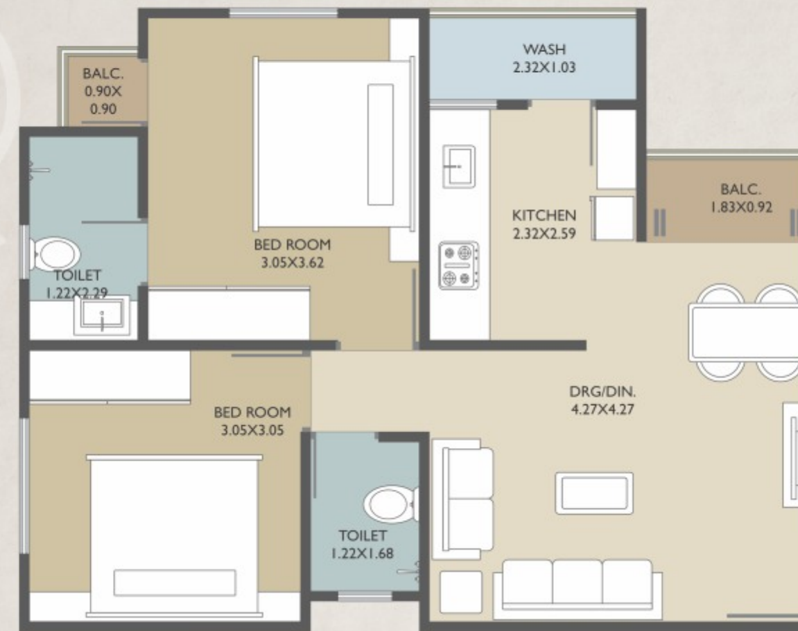
TOWER E-F 2 BHK TYPICAL FLOOR PLAN