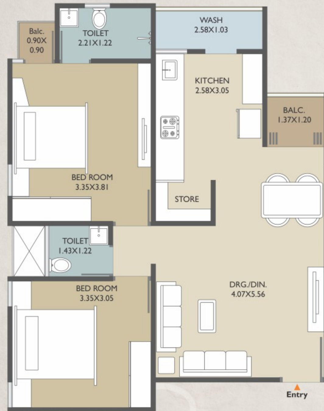
TOWER A-B-D 2 BHK TYPICAL FLOOR PLAN